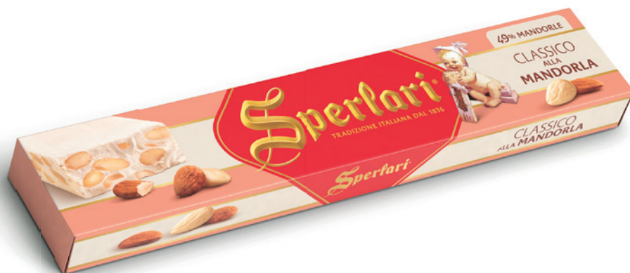
CLASSIC HARD NOUGAT W/ALMONDS