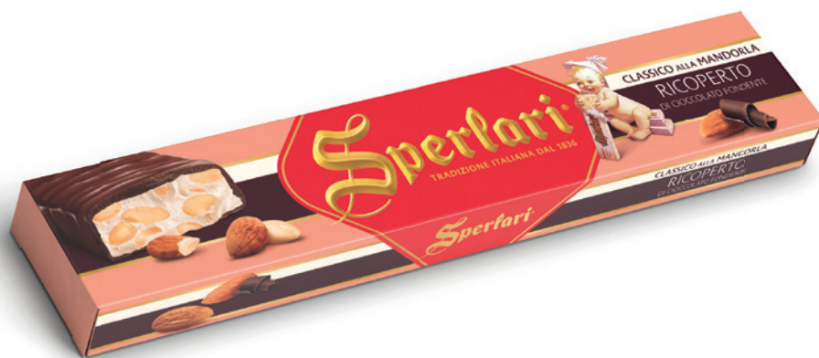
CLASSIC HARD NOUGAT W/ALMONDS