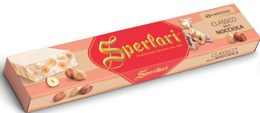
CLASSIC HARD NOUGAT W/HAZELNUTS