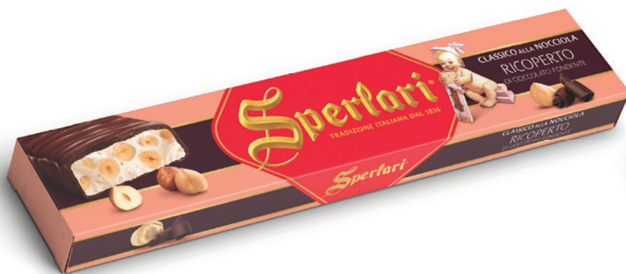
CLASSIC HARD NOUGAT W/HAZELNUTS