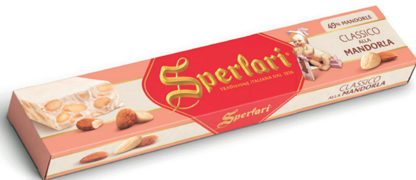
CLASSIC HARD NOUGAT W/ALMONDS